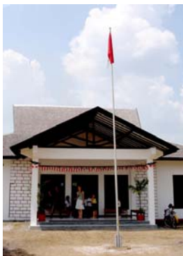
Grade 1 students play Limbo in the new building