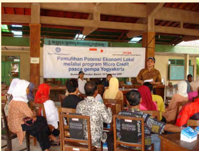
Micro credit projects to small scale entrepreneurs