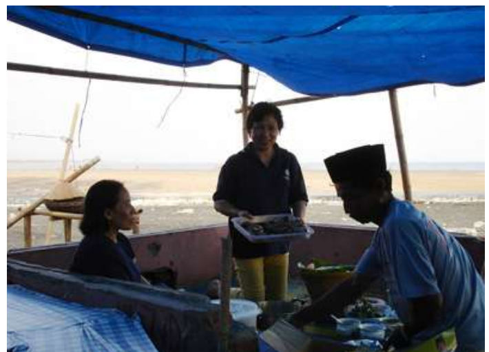
Late lunch served by the fishermen families at Parigi

From Parigi village we went to Pangandaran, which is a resort location. Tourists are still rare, either from domestic or abroad. Some of hotel buildings that broke-down were still left un-repaired. Local people complained about rare