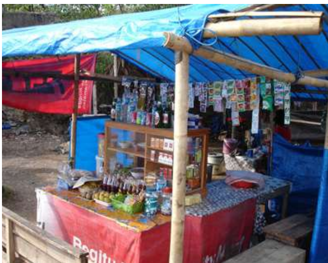
small shop at Pangandaran

The main income of people in this area are coming from fishing/collecting of sea products, tourism and conservation area. Most of the people become fishermen or the owner of small shop, food stall and restaurant.