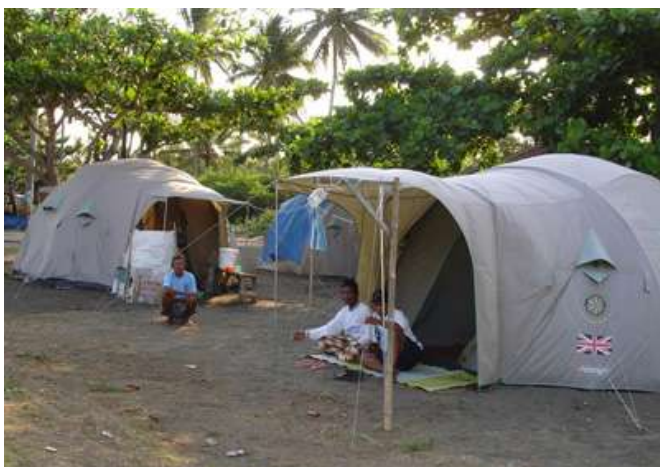
Until now the people in Parigi who lost their houses by tsunami are still living in tent

According to the fishermen after the tsunami the sea become full of fish. Unfortunately, quite a number of boat and fishing equipments were badly broke and useless. In addition, they