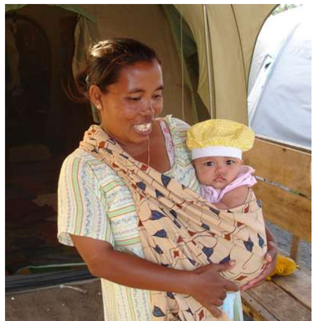
The tsunami baby with her mother, they are still living in tent up to now

During previous emergency response, SDI distributed relief goods such as rice, blankets, food, tents etc. The men of Perum are all fishermen. A number of family owned small shop that sells daily necessities. The shop of Village Cooperative (KUD) has not yet normally functioned. In normal condition, KUD receives 12% of total fish-selling,