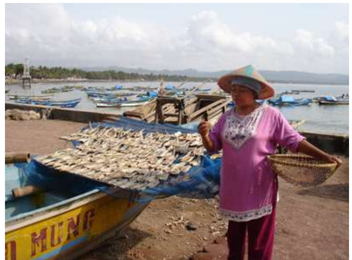
Drying up salted fish under the sun

Our plan is to provide small scale credit with duration between 3 to 6 months for these micro business players with commitment to pay back the capital.