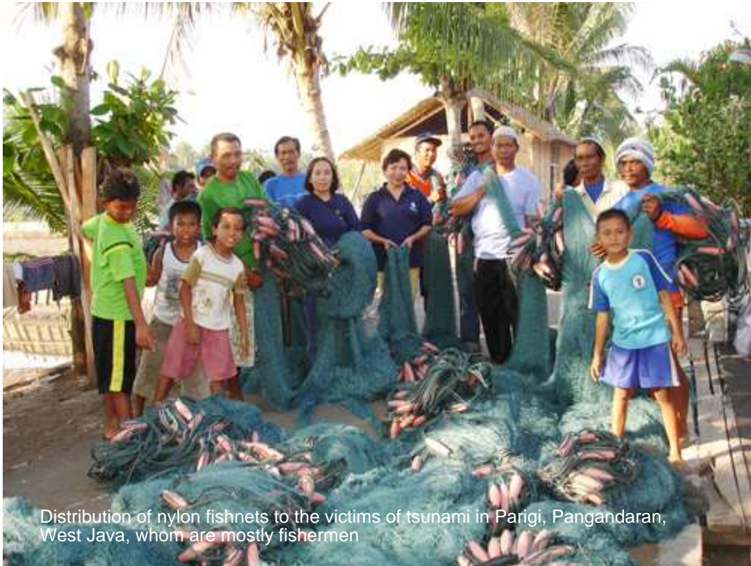
Distribution of nylon fishnets to the victims of tsunami in Parigi, Pangandaran, West Java, whom are mostly fishermen

On the occurrence of natural disaster of earthquake and tsunami along the west coastal area of Java, from Pangandaran beach to Cilacap July 15 2006, SDI through Subud West Java coordinated by Ibu Sutinah has distributed relief on several phases. Phase 1 to 3 is an emergency response and eventually the relief led to the phase of community's economic recovery.